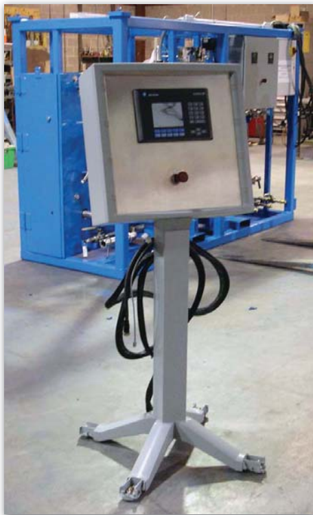
Stand-alone pedestal with Programmable Logic Control (PLC) touch screen controls permits easy, remote operation.

Since the RWRO™ system was installed at ANO Unit 2 in January 2014, average non-gaseous LRW effluent activity has been reduced from 3.73E^{-5} to 1.16E^{-7} mCi/ml, an improvement of over two decades. Process flow rate has been tripled and no waste has been generated in 18 months of operations, though the projected annual average waste volume is 30 to 40 cf/year of ion exchange media. During the first 1½ years of operation, all water has been decontaminated in a single pass without chemical treatment.